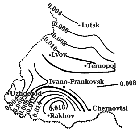
Fig. 2. Western Ukraine gravity change as a result of movement of air masses [Dvulit, 1999].

In (Geophysics, 2008. — 73, № 6) does not take into account the peculiarity of the gravity variations: a fluctuations in the value of its derivatives depend on the fluctuations of the low-level geophysical events (as anomalous atmospheric masses (Fig. 2),